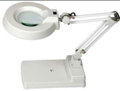
Magnifying Lamp (3X, 5X) - Desktop Type