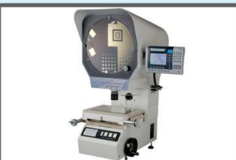
Digital Video Profile Projector (Vertical/Horizontal Type)