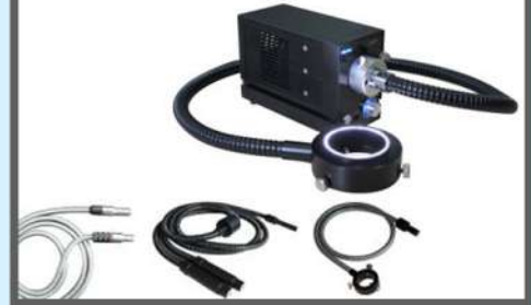
Fiber Optic Lighting (with various light guide)