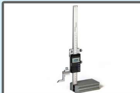
Digital Height Gauge