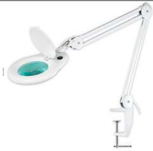
Magnifying Lamp (3x, 5x) - Clamp Type