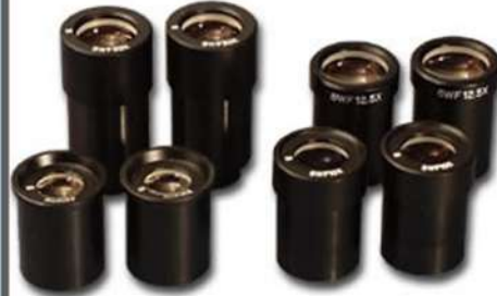
Microscope Eye Pieces