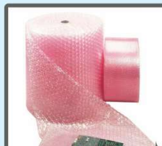
Anti-Static Air Bubble Pack