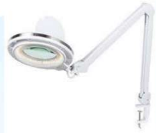
LED Magnifying Lamp - 96 pcs of LED