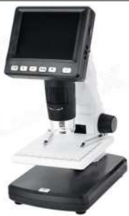
3D LCD Zoom Microscope