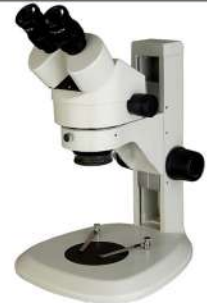
Low Power Microscope