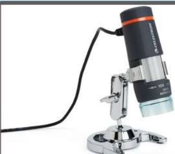
Hand Held Microscope with image capturing, measuring software