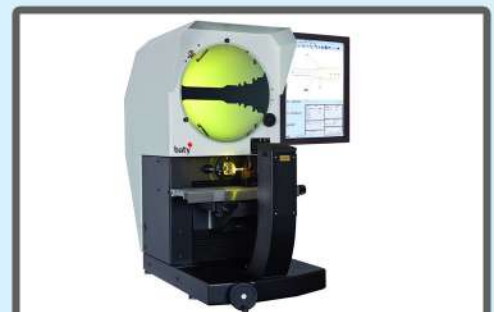
14HE Light Path Comparator