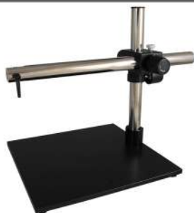
Boom Stand for Low Power Microscope