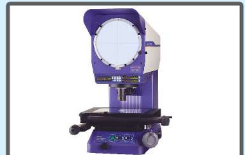
Profile Projector (Vertical/ Horizontal Beam Type)