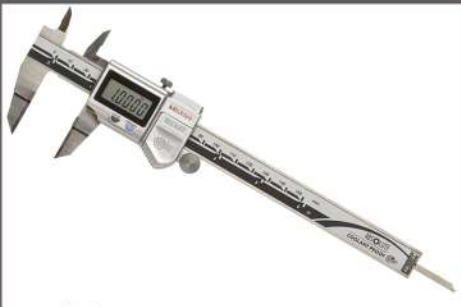
Vernier & Digital Caliper