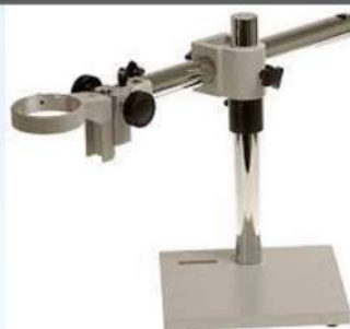
Big Base Stand for Low Power Microscope