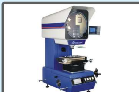
16H Benchmark Horizontal Light Path Comparator