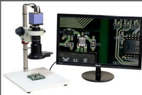
Zoom Optical Monitor Inspection System