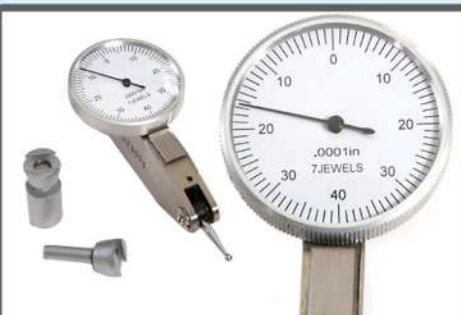
Dial Test Indicator