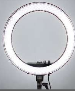
LED Ring Light