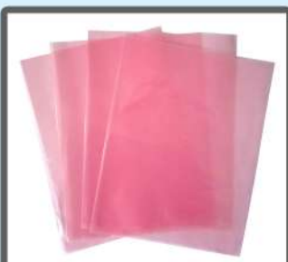
Anti-Static PE Bags