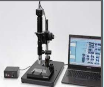
High Magnification zoom microscope with software