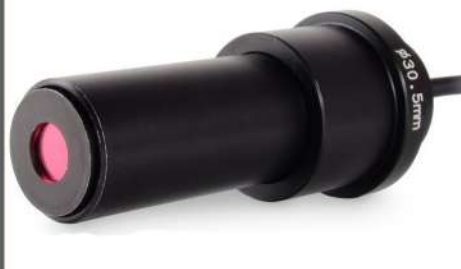
Digital Eye Piece camera with image capturing, measuring software