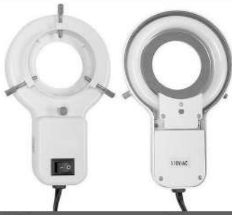
Fluorescent Ring Light (8,10 Watts)