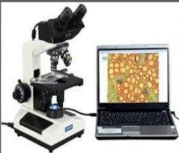
Digital Camera with imaging software from 1.3MP to 5MP