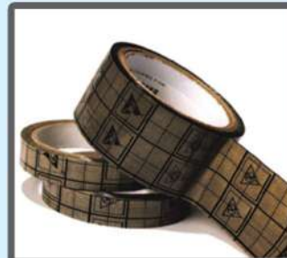
Conductive Grid Tape