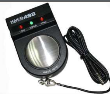
Wrist Strap Tester