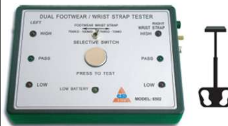
Mega Combo Tester Dual Footwear & Wrist Strap Tester