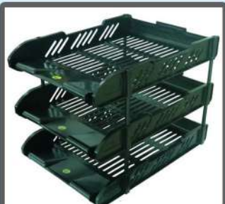
ESD Document Rack