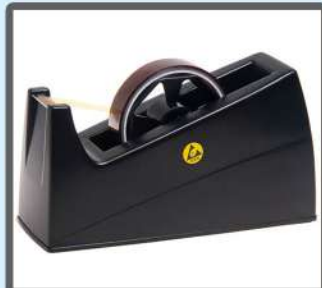
ESD Tape Dispenser