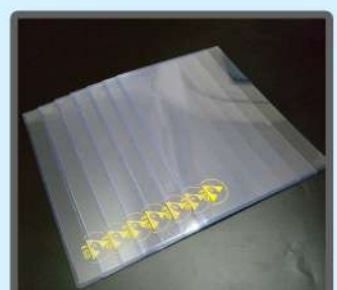
ESD A4 Hard Document Holder