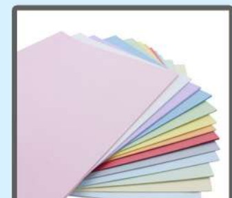
Cleanroom Lint Free Note Book