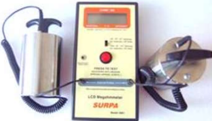
Mega OHM Meter (Surface Resistance Meter)