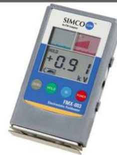
Mega SFM Static Field Meter