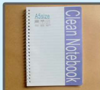
Cleanroom Lint Free Note Book