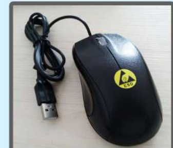
ESD Computer Mouse