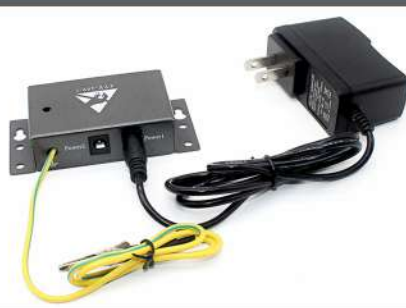
Single Wrist Strap On-Line Monitor