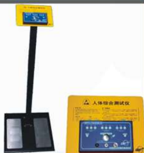
Mega Combo Tester Dual Footwear & Wrist Strap Tester