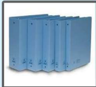
ESD Homogenous Vinyl Ring File Binder