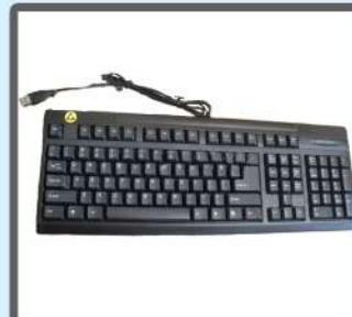
ESD Computer Keyboard