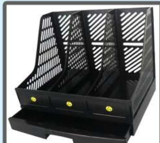
ESD Files Holder