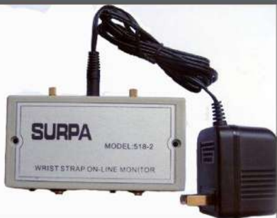
Twin Wrist Strap On-Line Monitor