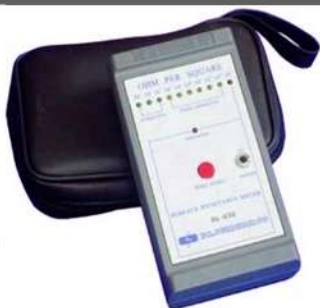
Mega SRM Surface Resistivity Meter