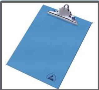
ESD Homogenous Vinyl Clip Board